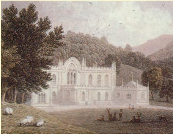
Plas yr Hafod The Hafod Mansion

In the late eighteenth century the Hafod Estate was designed in the Picturesque style by Thomas Johnes and became an essential destination for visitors touring Wales. Today the mansion is gone but the historic walks network has been restored to allow you to enjoy this special landscape.