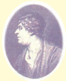
Thomas Johnes 1748 - 1816

Yn niwedd y ddeunawfed ganrif dyluniwyd Stad yr Hafod mewn dull 'Darluniaidd' gan Thomas Johnes a daeth yn gyrchfan anhepgor i ymwelwyr ar daith ar draws Cymru. Heddiw does dim ar ôl o'r plasty ond mae'r rhwydwaith o lwybrau hanesyddol wedi cael eu hadfer i'ch caniatáu i fwynhau'r tirlun arbennig.